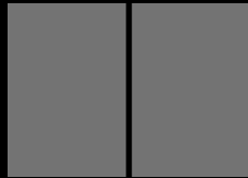
DOUBLE PAGE SPREAD